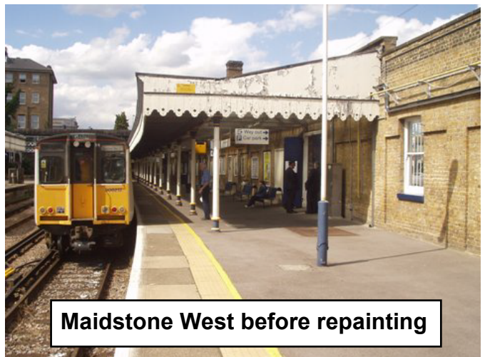
Maidstone West before repainting

marketing the line to local people as well as visitors to the area. The Medway Valley Line is an underused asset and we intend to make the line play a more vital role in future.