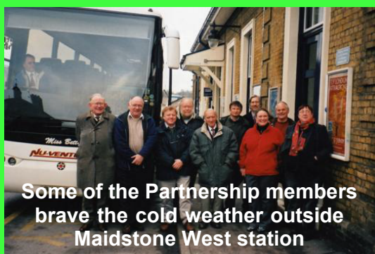
Some of the Partnership members brave the cold weather outside Maidstone West station

Members of the Line Partnership recently undertook a tour of the whole Medway Valley Line - not by train, but by road!