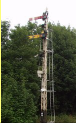
Old signals at Aylesford

Regular travellers may have noted the intense activity that was occurring during the autumn when new colour light signalling was being installed along the full length of the line.